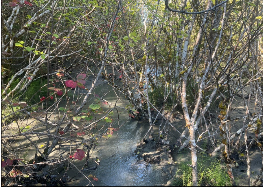
Figure 2.—Stream in the alder thicket, looking downstream at waypoint 1139.