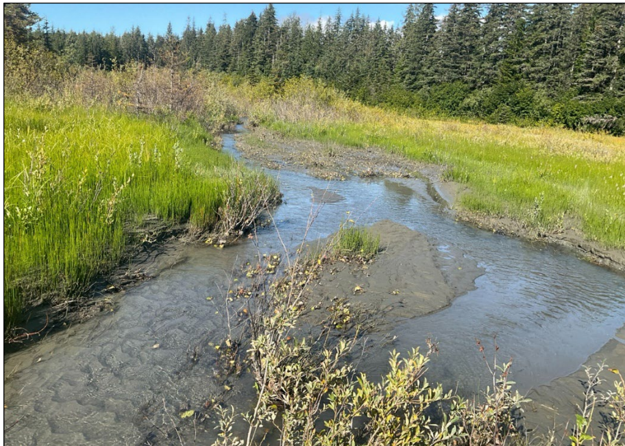
Figure 3.—Stream braid going out into the meadow, looking downstream at waypoint 1139.