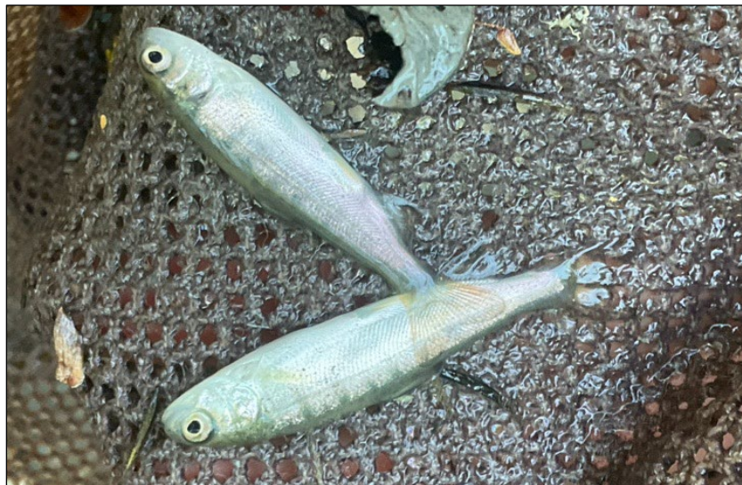
Figure 1.–Juvenile coho salmon caught at waypoint 1139.